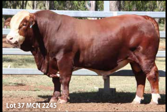
Lot 37 MCN 2245