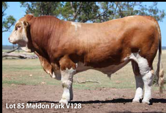
Lot 85 Meldon Park V128