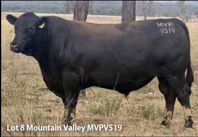
Lot 8 Mountain Valley MVPV519