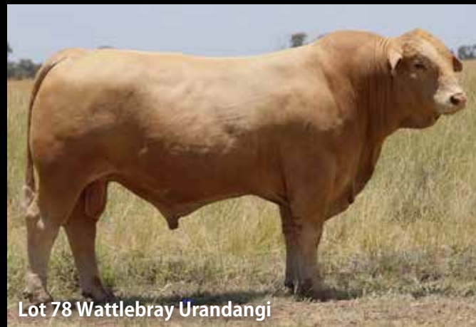
Lot 78 Wattlebray Urandangi