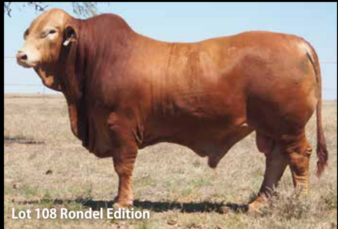
Lot 108 Rondel Edition