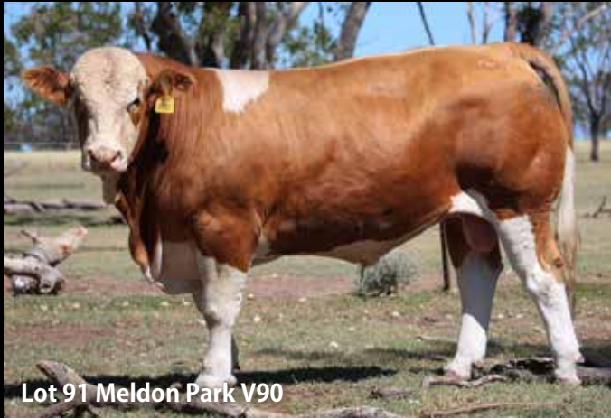
Lot 91 Meldon Park V90