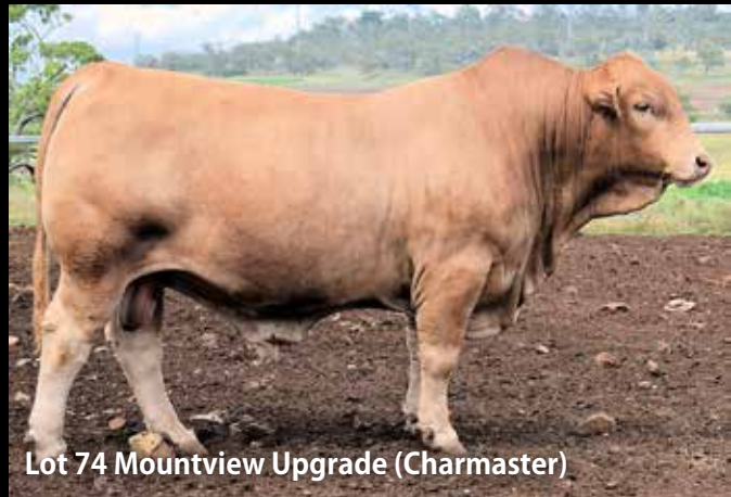
Lot 74 Mountview Upgrade (Charmaster)