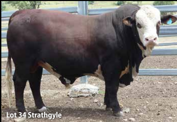
Lot 34 Strathgyle