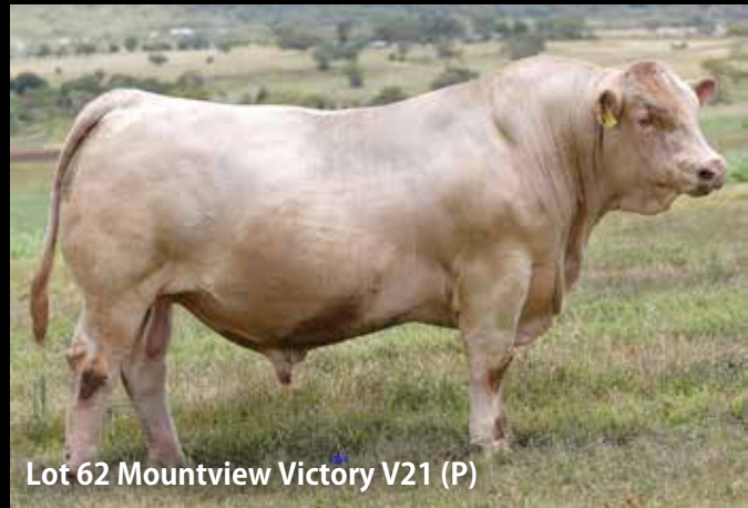
Lot 62 Mountview Victory V21 (P)