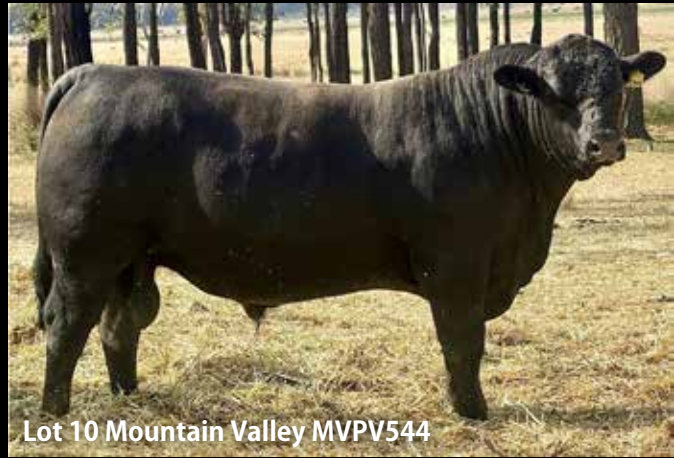
Lot 10 Mountain Valley MVPV544