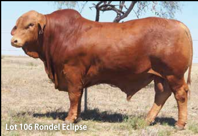
Lot 106 Rondel Eclipse