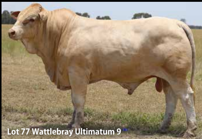
Lot 77 Wattlebray Ultimum 9