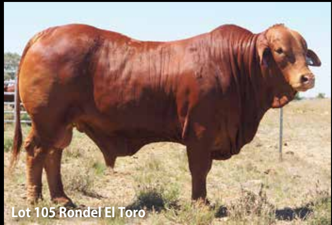
Lot 105 Rondel El Toro