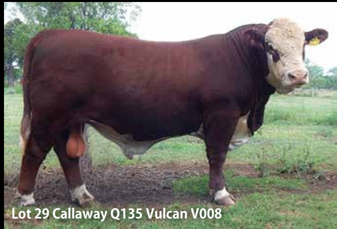
Lot 29 Callaway Q135 Vulcan V008