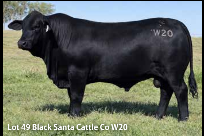
Lot 49 Black Santa Cattle Co W20