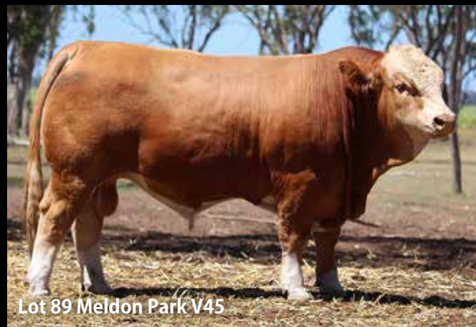
Lot 89 Meldon Park V45