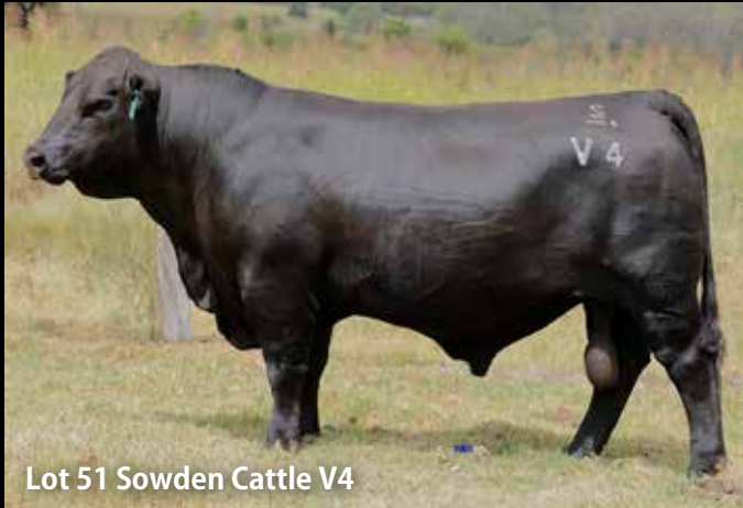
Lot 51 Sowden Cattle V4