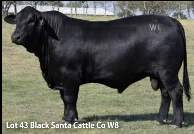
Lot 43 Black Santa Cattle Co W8