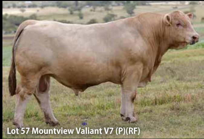
Lot 57 Mountview Valiant V7 (P)(RF)