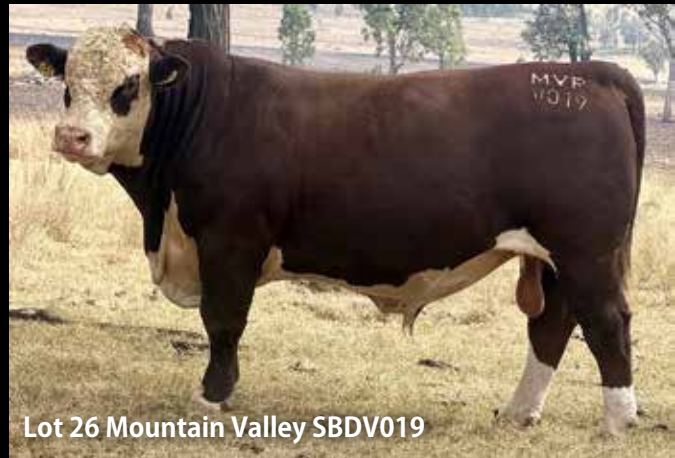
Lot 26 Mountain Valley SBDV019